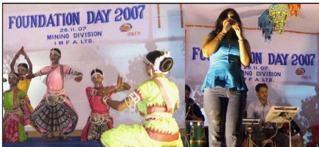
Scenes from Goti Pua Dance & Melody program.