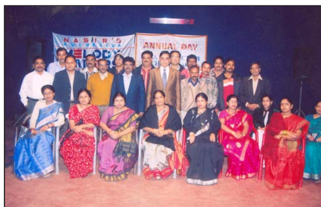
Office bearers of IMFA Club