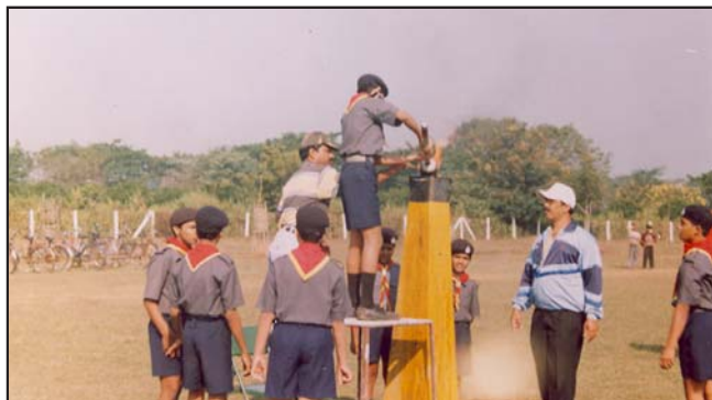
Lighting of Torch to start the athletic meet.