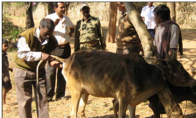
Veterinary camp in progress