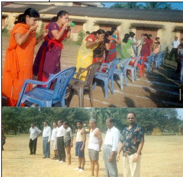
Scenes from Annual Sports