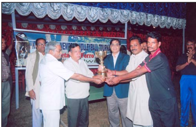
Winners receiving their trophy.