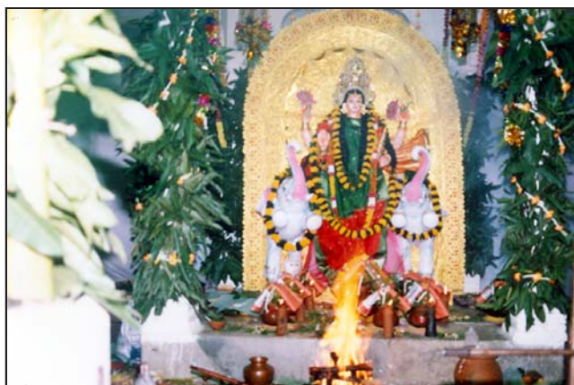
Beautiful idol of Goddess Laxmi