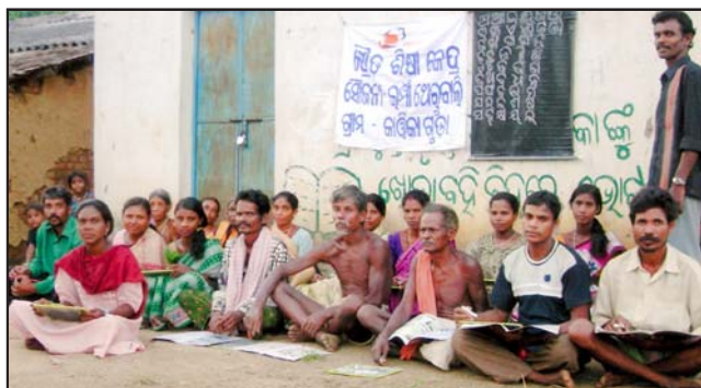
A scene from adult education center.