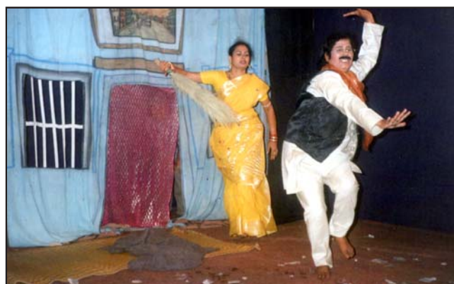
A scene from drama 'Patent Medicine'