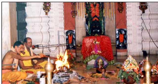
Yagnya on the occasion of Durga Puja

Durga Puja was celebrated from 18.10.2007 to 21.10.2007 in the Laxmi Narayan Temple. The grandeur of decoration inside the temple attracted a huge crowd from far-off places.