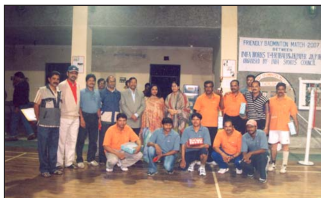
Both the teams with the guests.