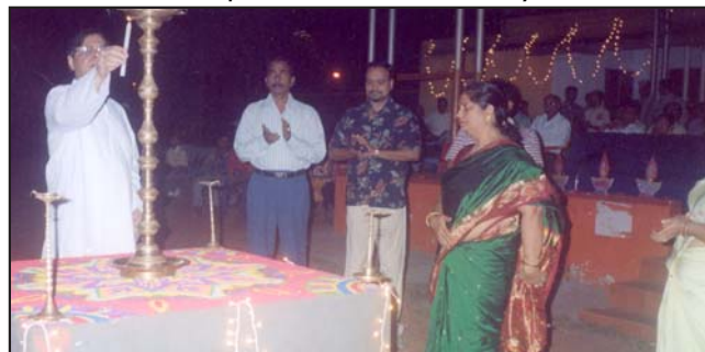
A scene from Diwali celebrations.

Diwali, the festival of lamps was celebrated by the IMFA Staff Club on 09.11.2007 with a fantastic decoration by the ladies members. A Fire Cracker show was organised in the evening. Recreation Club also organised a decoration of lamps & fireworks in Colony-II.