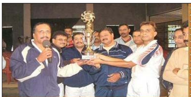
Winners - Team CHQ.