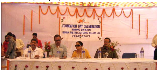
The dais at the Foundation day function.