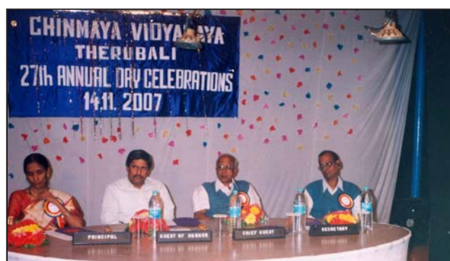
The dais at the Annual Day celebrations.