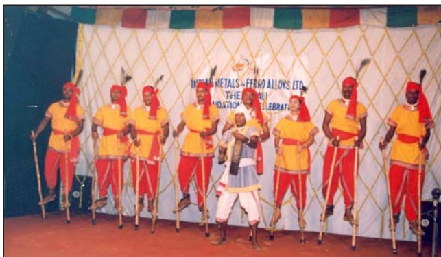
A scene from cultural program