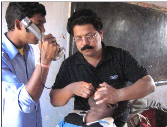
Dental camp in progress.

Dental Camp: A dental camp was organised on 23.11.2007 at Chandimata UP School, Kaliapani. A team of dental Surgeons carried out the camp. 153 patients were provided with free treatment and medicines.