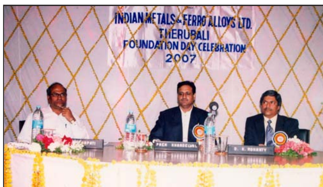
A scene of the dais at the Foundation Day function.