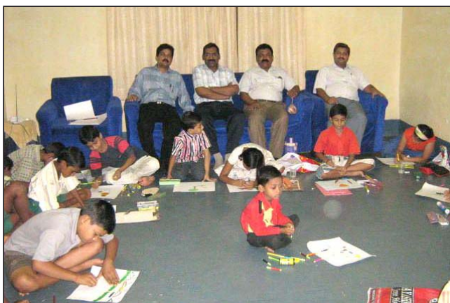
A scene from the group drawing competition.